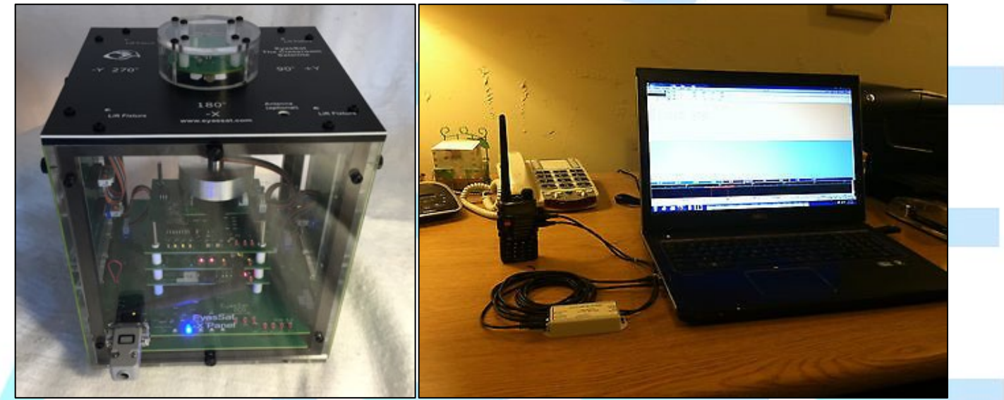
Figure 1 – (a) Classroom Satellite Kit, (b) Packet Radio Communication